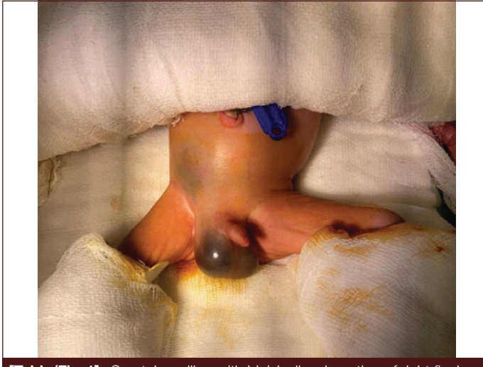
[Table/Fig-1]: Scrotal swelling with bluish discolouration of right flank.

One unit of FFP was transfused postexploration. Paracetamol drops were given for analgesia. The baby was then extubated 24 hours after surgery, and was put on bubble Continuous Positive Airway Pressure (CPAP) support. An ultrasonographic assessment of the abdomen was done on the third day of life, which revealed a heterogeneously hyperechoic area measuring approximately 1.75 \times 1.7 \times 1.2 cm, with 1.8 cc of volume in the right adrenal, which was suggestive of right adrenal haematoma [Table/Fig-5].