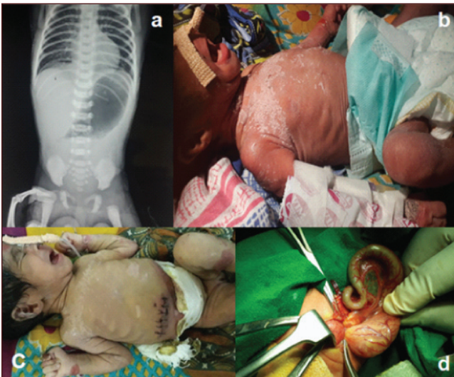
[Table/Fig-3]: Intestinal atresia: (a) Plain radiograph showing single gas shadow suggestive of pyloric atresia; (b) Associated with epidermolysis bullosa; (c) Postoperative picture of pyloric atresia; (d) Intraoperative photograph of Type I colonic atresia.