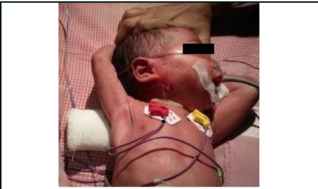
[Table/Fig-2]: Clinical photograph depicting a parotid abscess with exudation of pus from incision site.

oxygen supplementation for 2 days after which she could be weaned to room air. Her thrombocytopenia improved over the time. Initially, she was commenced on oro-gastric tube feeds, oral feeds were initiated after resolution of respiratory distress and she was started on breast feeds on day 7 of hospital stay. IV Meropenem was given for a total duration of 14 days.