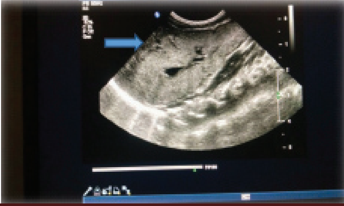
[Table/Fig-4]: Showing cataract. [Table/Fig-5]: USG abdomen showing renal cysts.