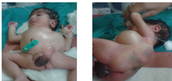
[Table/Fig-1]: shows gross appearance of baby with large lump in the left lumbar region, small swelling in left inguinal region and a cystic swelling over the back

protruding from left lateral lumbar abdominal wall containing bowel loops, hemivertebrae defects of all lumbar vertebrae with a compensated scoliosis that was not apparent on physical examination. Cross-table prone lateral radiographs revealed findings suggestive of a high anorectal malformation. Ultrasonogram (USG) spine showed a cystic swelling of size 5×2cm herniating from lateral element of vertebra in thoracolumbar region suggestive of meningomyelocele. Left kidney was not visualised in left renal fossa however was seen in right side fusing with the right kidney suggestive right crossed fused ectopic kidney. CECT [Table/Fig-3a,b] confirmed all the findings with left lumbar herniation of spleen and bowel loops, right crossed fused ectopia, lumbar hemivertebrae, thoraco lumbar meningomyelocele and left inguinal hernia. DNA microanalysis was not performed, however, chromosomal analysis showed normal male karyotype. In view of multiple anomalies parents refused to give consent for any surgical intervention. Baby expired on day 5 of life due to severe septic shock.