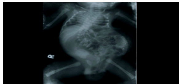
[Table/Fig-2]: Shows the infantogram depicting hemivertebrae of lumbar region with scoliosis and a large abdominal wall defect along with herniation of viscera in the left lumbar region